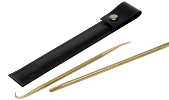
Brass pick and spat shown above.

Note: Private labeling is available upon request.