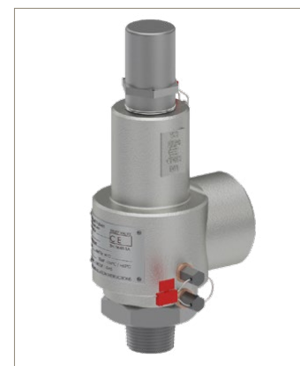
Parker Bestobell Cryogenic Safety Relief Valve in Stainless Steel without Lever (Male NPT Inlet x Female NPT Outlet; No Drain)

BEP-Bestobell / Bestobell-Aquatronix 2880 Argentia Road, Unit 3 Mississauga, ON, L5N 7X8 Tel. 905-826-1953 / Fax 905-826-1778 www.bestobell.com