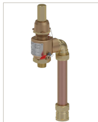
Parker Bestobell Cryogenic Safety Relief Valve in Bronze without Lever (BSP-TR Male Inlet x BSP-PL Female Outlet; Inlet Adaptor, Elbow, Downpipe & Coupling)

BEP-Bestobell / Bestobell-Aquatronix 970 Montée de Liesse, #204 St. Laurent, QC, H4T 1W7 Tél. 514-331-1225 / Fax 514-331-4255 www.bestobell.com