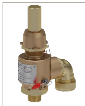
Parker Bestobell Cryogenic Safety Relief Valve in Bronze without Lever (BSP-TR Male Inlet x BSP-PL Female Outlet; Elbow)

BEP-Bestobell / Bestobell-Aquatronix 2880 Argentia Road, Unit 3 Mississauga, ON, L5N 7X8 Tel. 905-826-1953 / Fax 905-826-1778 www.bestobell.com