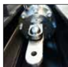
Designed for easy setup and tooling