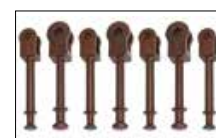
701.050, 701.051, 701.052, 701.053 Fork head connector with bolts (insulators)

We reserve the right to make technical changes without notice. Options are machine parts that can only be ordered while buying the machine.