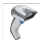
BCR CtrlC Barcode scanner