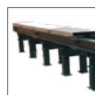
701.2200 Extension element 3000 mm