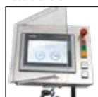
807.2 Screen protector