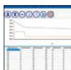
UTS/UDL Data transfer