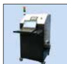
Swivelling notebook shelf

The ITM 300 is a drawing bench designed for the testing of insulators. As safety comes first, insulators must meet stringent safety standards – even under extreme loads. To ensure that they meet these requirements, UNIFLEX has designed a sturdy, special drawing bench for insulator testing.