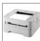
888.074 Network printer