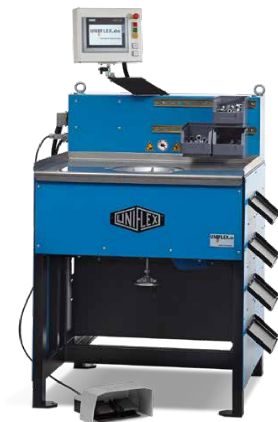
KS 6, KS 8, KS 10

The UNIFLEX KS 6, KS 8 and KS 10 are designed for precision crimping and calibration.