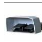
PS Double foot pedal