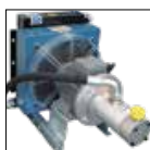
OC KS6/KS8 MVA