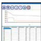
UTS/UDL Data transfer