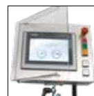
807.2 Screen protector