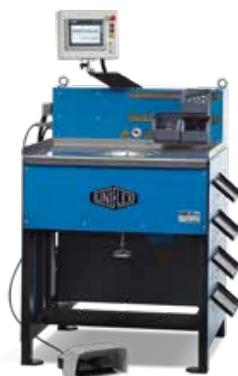
KS 6, KS 8, KS 10