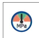
Crimping by Pressure