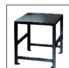
TU Work Bench