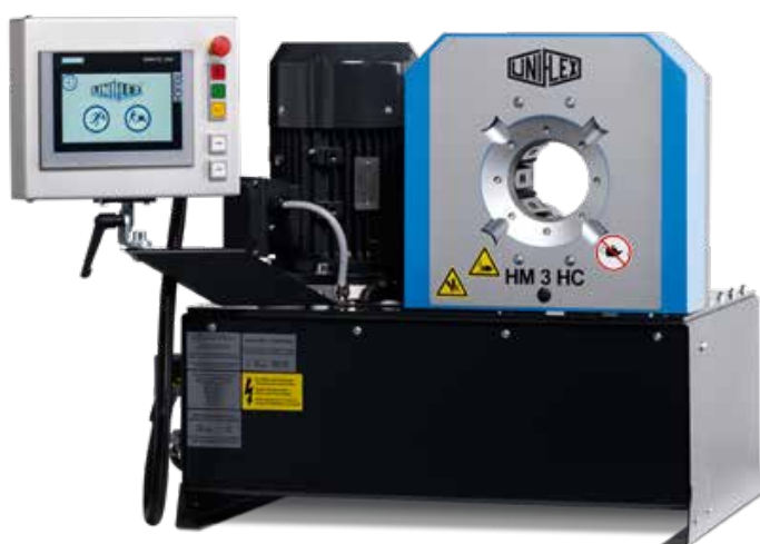
HM 3 H

Due to its narrow and innovative construction, high level of user friendliness, and long service life, the HM 3 H sets new standards for quality and cost effectiveness. Thanks to its compact construction, it allows easy, uncomplicated, and "fast" crimping. The intuitive UNIFLEX Software on the convenient Control C.2 Touch completes the HM 3 H and ensures product quality. The HM 3 H is compact and easily accessible.