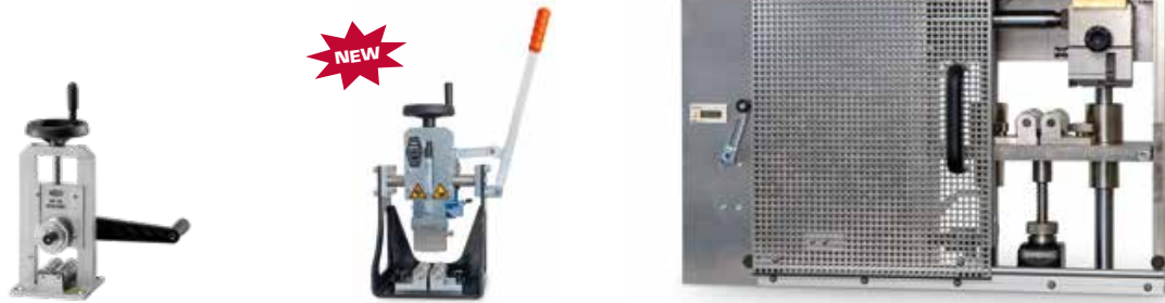
UP 10 Ecoline UP 15 UP 115**