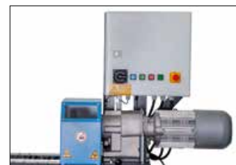
Security Cover (UNT 6)