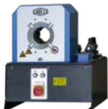
S 3 Ecoline