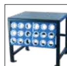
TU Rack PB239