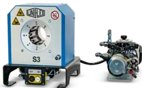
S 3 L Mobileline (131 kg) With die package (148 kg)