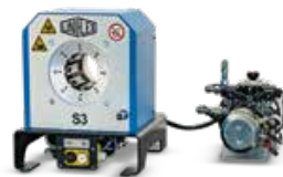
S 3 L Mobileline