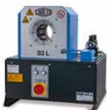
S 3 L Ecoline