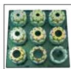
QDS 239 B