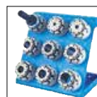
QDS 239 R