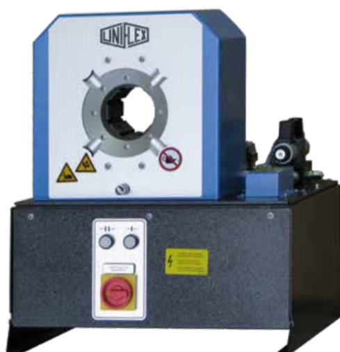
S 3 Ecoline

Due to its narrow and innovative construction, high level of user friendliness and long service life, the S 3 sets new standards for quality and cost effectiveness. Its compact construction allows for ergonomic working. The use of long master dies allows you to crimp 90° elbow fittings up to 1¼" with the tried and tested greaseless slide bearing technology, which reduces maintenance costs and increases the product quality.