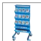
QDS 239 C