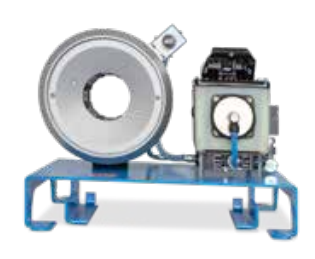
S 2 P S 2 A

The lightest crimper with the biggest opening in its class