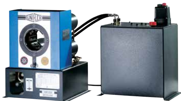
HM 200 Ecoline