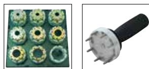
QDS 239 B