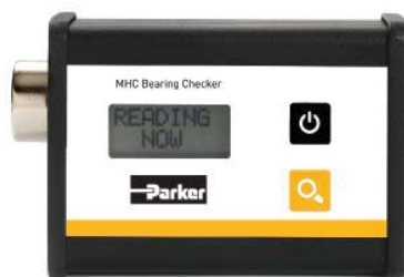
*MHC - Machinery Health Check