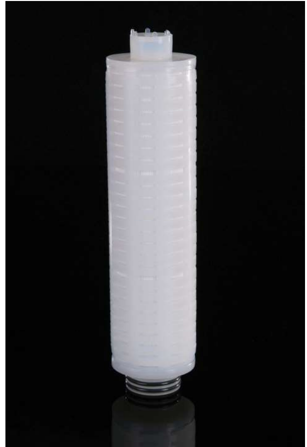
Note: TETPOR is a registered trademark of Parker Hannifin Corporation.