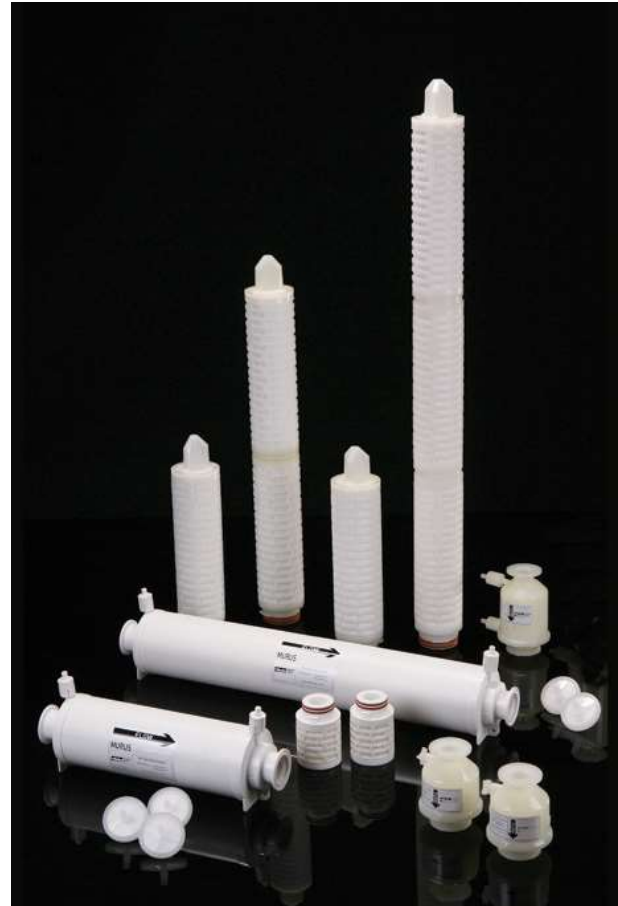
Note: TETPOR is a registered trademark of Parker Hannifin Corporation.