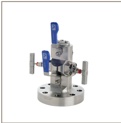
Double Block and Bleed valve straight through bore twin vent

ports on wellhead assemblies. Parker also supplied similar valves for the high pressure protective systems (HIPS) that the company uses for wellhead flowline pressure protection. The valves feature Parker Autoclave female outlets machined within their hubs, to provide the customer with the option of using direct or remote mounting pressure transmitters.