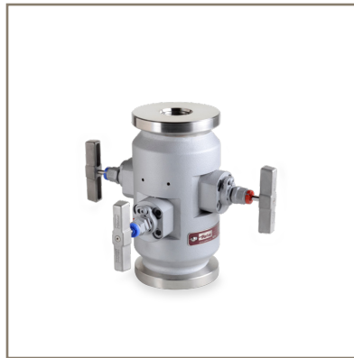
Double Block and Bleed utilising heavy-duty needle valves