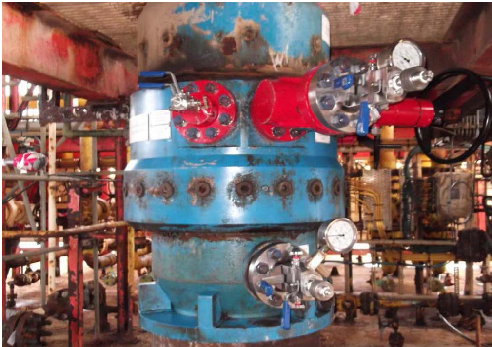
Wellhead assembly annulus